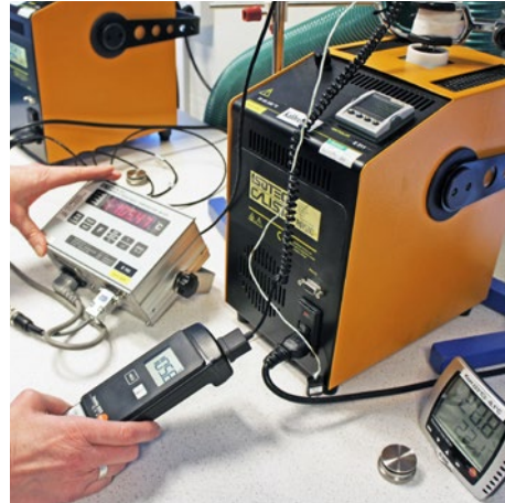
Calibration of temperature in miniature liquid bath.

Hardness tester for rubber and plastic in the scales IRHD and Shore are calibrated both in our laboratory and in the field. Reference blocks for Shore and IRHD are calibrated in our laboratory.