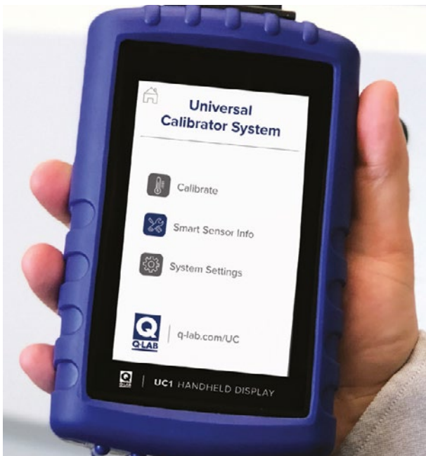
Universal Calibrator (UC) System for calibrating irradiance and temperature in QUV and Q-SUN Weathering Test Chambers.

We offer calibration and service of Q-Lab's equipment for weathering, light stability, and corrosion for customers in Sweden, Norway and Denmark.