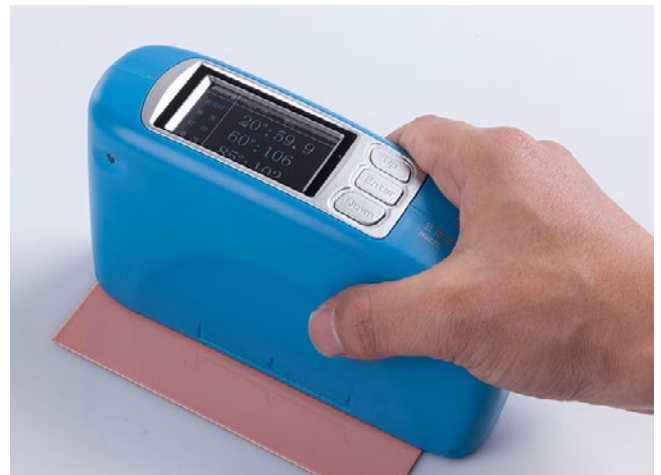
Gloss meter with three angles: 20°/60°/85°.