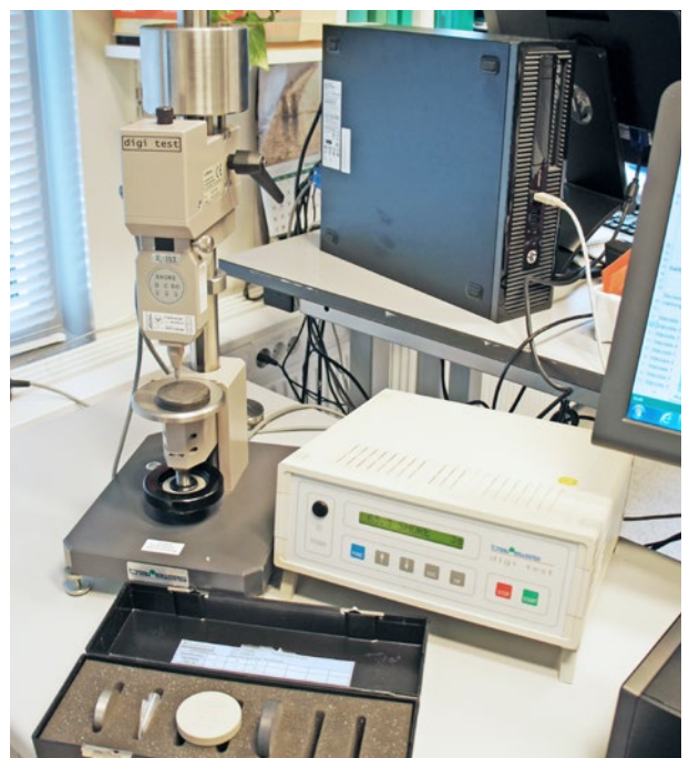
Calibration of reference blocks.