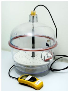
Calibration of hygrometer.

Hygrometers are calibrated in our laboratory, whilst climate chambers most often are calibrated in the field for practical reasons.