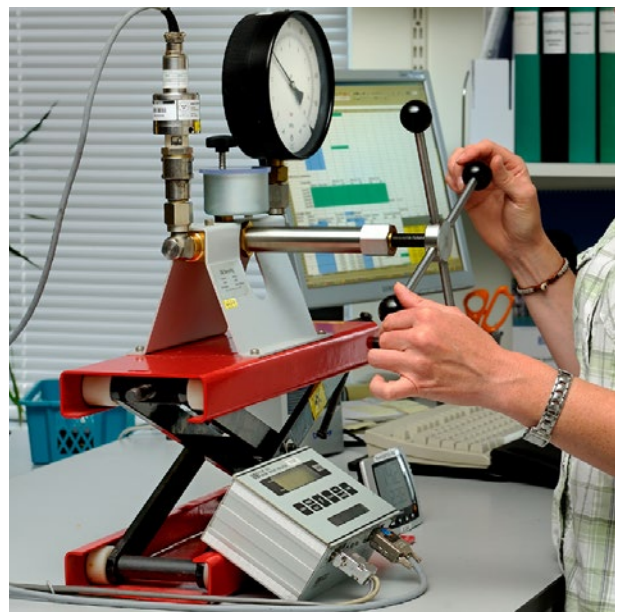
Calibration of manometers.