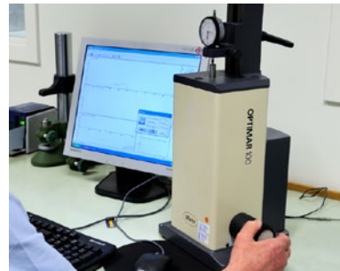
Tester for dial indicators.

Height gauges and profile projectors are often calibrated in the field and this is usually done in the context of the calibration of the surface plates.