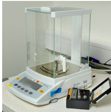
Calibration of laboratory scale.

We are accredited for calibration of balances/scales up to 150 kg. Scales up to 5 000 kg we can calibrate with traceability according to our own method.