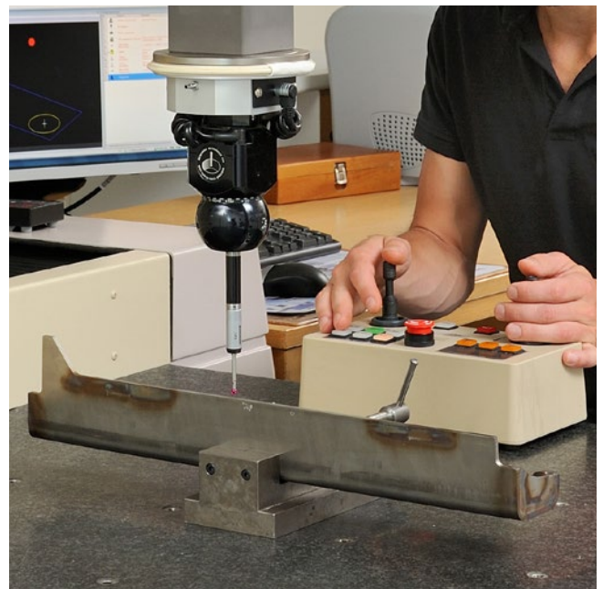
Measurements in our coordinate measuring machine.

We can also assist with technical measuring advice.