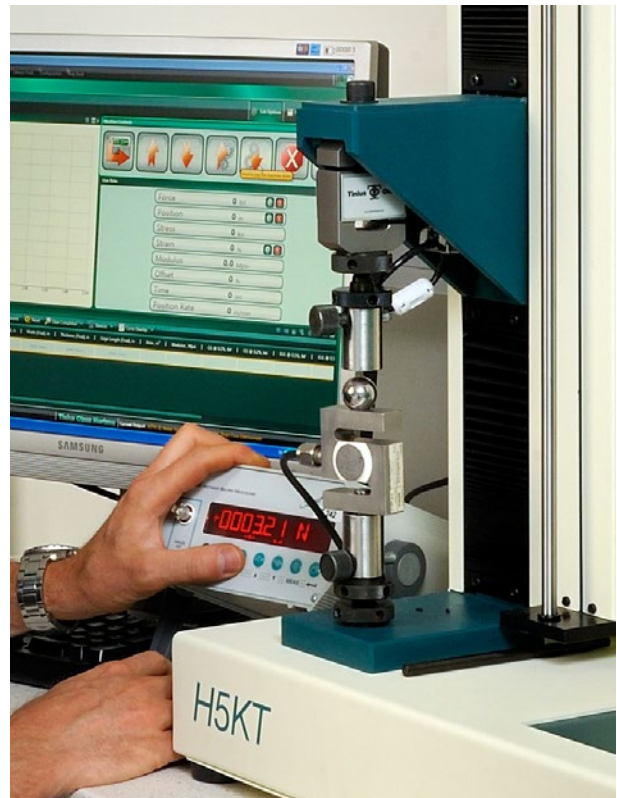
Calibration of tensile tester.

Flow meters for ageing cabinets and analytical instruments we can calibrate for flows up to 20 l/min.