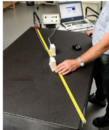
Calibration of surface plates.

These are calibrated with one of our developed methods.