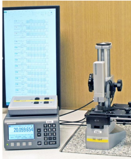
The Gauge Block Comparator increases the accuracy and speed when calibrating gauge blocks.

Flatness calibration up to 5 000 mm. Remember that a surface plate is a reference surface. These are usually calibrated in the field.