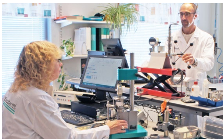
The general laboratory for calibration at 23 °C. In addition to this we have a constant room for calibration of length at 20 °C ± 0,5 °C, and a room for temperature calibration.

The measurement uncertainty is the uncertainty in the calibration result that is remaining after calibration. The uncertainty is calculated for each measuring situation. In the uncertainty are among other things the standards' accuracy, the calibrated instruments resolution as well as ambient factors such as temperature etc included.