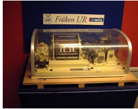
The old retired speaking clock service is found at RISE Research Institutes of Sweden, located in Borås, where you can find the new speaking clock service as well.