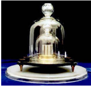
Swedens national kilogram no 40 from 1889.